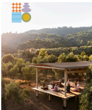
Peli Kastri Guesthouse & Retreat, Pilio, Greece